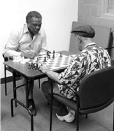
Chess players at Davis Center ▼