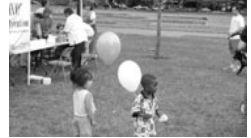
▶ Game Plan open house, June 2001