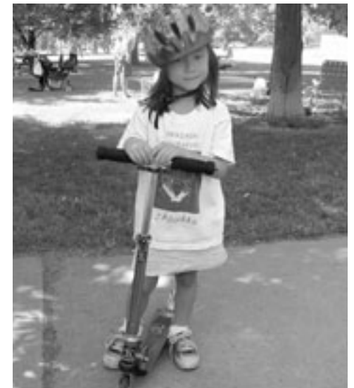
Congress Park scooter ▲

“Priorities for DPR programs should be youth and seniors. Adults consistently rated last.”