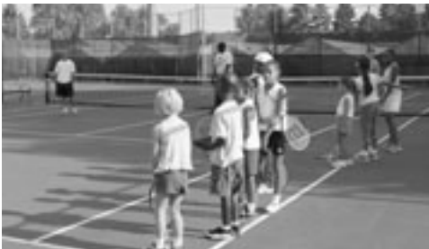
▲ Park festival, circa 1960