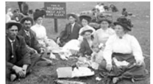
▶ City Park picnics, late 1800s