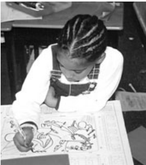
▲ Crofton Elementary students design a park

Those community patterns — of use, of values expressed, of ideas — are woven throughout the Game Plan . The 2001 Game Plan Survey , a statistically valid seven-page instrument, yielded 1,500 responses and provided extensive information on park and recreation use, values, and priorities. The survey reveals that residents greatly value all parts of Denver’s parks and recreation system and consistently support mountain parks and urban natural areas.