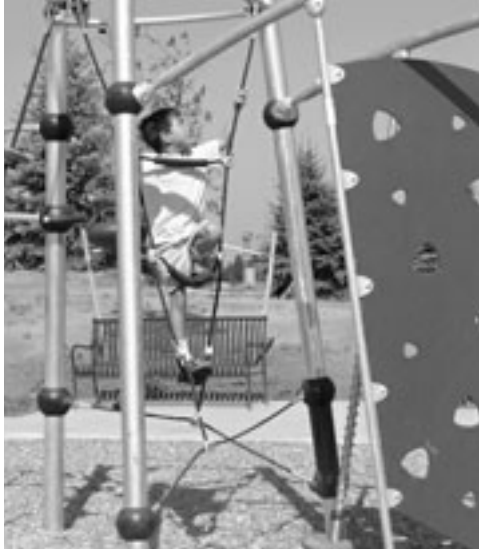
Contemporary playground at Lowry