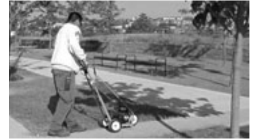
Edging Commons Park ▶

The Game Plan's financial proposals are based on analysis of existing infrastructure, identification of neighborhoods “in need,” and financial patterns over time. The recommendations vary from increasing public funding to compensate for chronic capital underfunding to improving our business relationships with service providers.