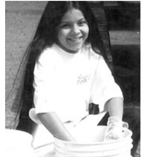
▶ “Hands on Denver” volunteer