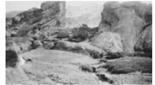
▲ Red Rocks, circa 1890

The issue is one of sustainability — of designing, building, and maintaining our resources responsibly so we will be able to appreciate them well into the future. That means building, adapting, and managing the park and