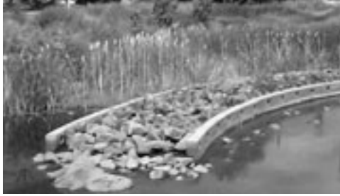
Stormwater carefully channelled and cleaned