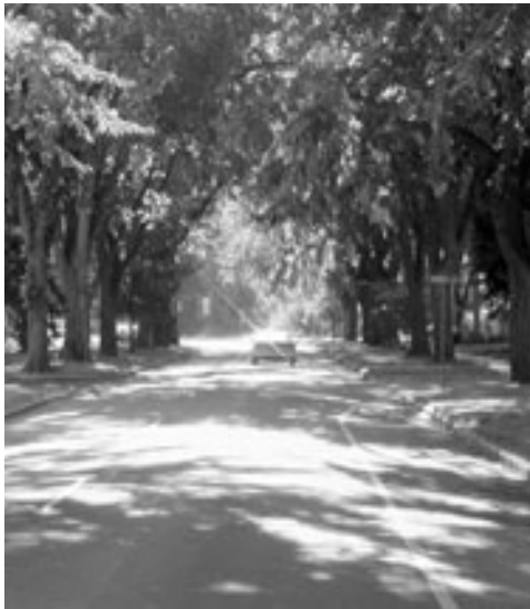
17th Avenue Parkway today