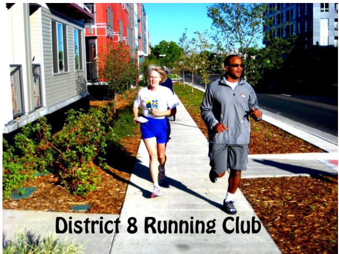
District 8 Running Club

Every Saturday at 8am, we have been meeting in a different neighborhood to run and explore the community. We have had over 75 pairs of shoes hitting the pavement!