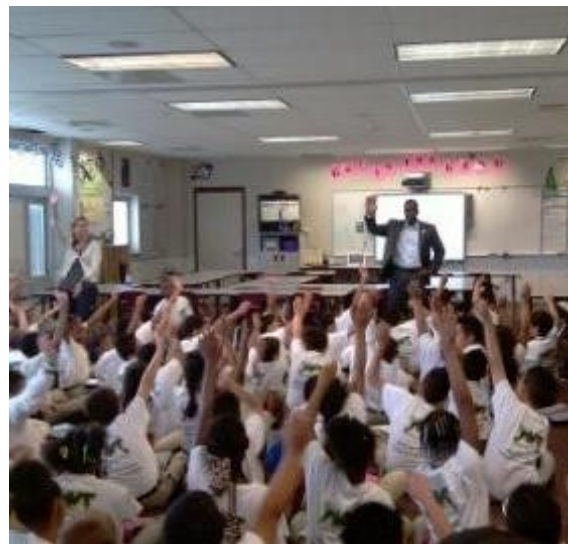
Raise of hands of who is going to college