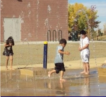
Splash play area where underground sensor-activated pumps spray water.