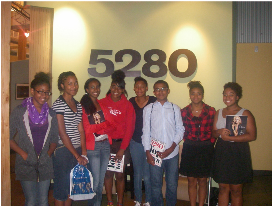
Northeast Denver Leadership Week participants pose for a photo after a tour of the 5280 The Denver Magazine office in Downtown Denver

“Selected students spent the first week in August touring different areas of the city, meeting civic and industry leaders telling their stories encouraging these future leaders that their opportunities are only limited by their imagination.”