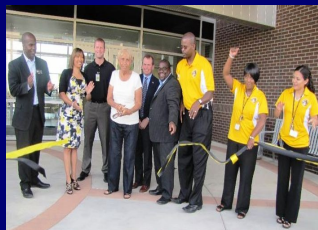
Vista Academy Ribbon Cutting, August 2011